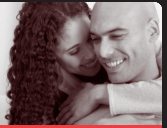
We believe in God.